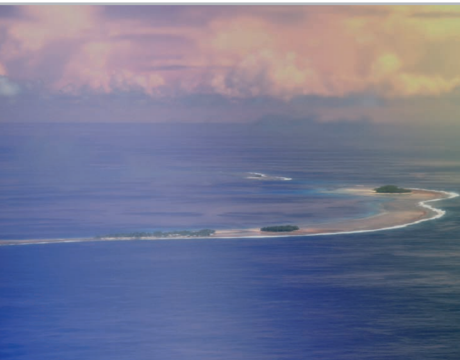
The islands of Tuvalu. Since importing plastic, there has been a rise in the number of incidents of illness associated with the additives in plastic

I wish I could say that the remaining shoots were trouble-free and that funding was the only obstacle, but we were plagued by bad weather and rough seas throughout. Now, 10 years after it all began, we are proud of the result and quite overwhelmed at the reception the film has received throughout the world. It has picked up 15 awards and been described by Sir David Attenborough as ‘The most important film of our time’. It was the inspiration for including plastics in the Blue Planet II series and was available on Netflix in 60 countries with subtitles in 15 different languages. It can now be seen on Amazon, iTunes and via the film’s distribution website