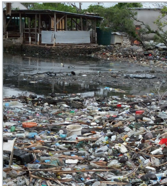
Tuvalu village where filming of the extended family took place