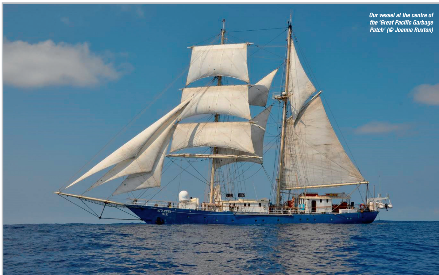
Our vessel at the centre of the 'Great Pacific Garbage Patch'

Jo: It was an 8-year process from deciding to make the film to its release in January 2017 and much of the delay was due to the difficulty of raising funds. It took 2-years of fundraising and research before we even ventured out to the Indian Ocean for our Blue Whale shoot and that one was far from easy. ▶