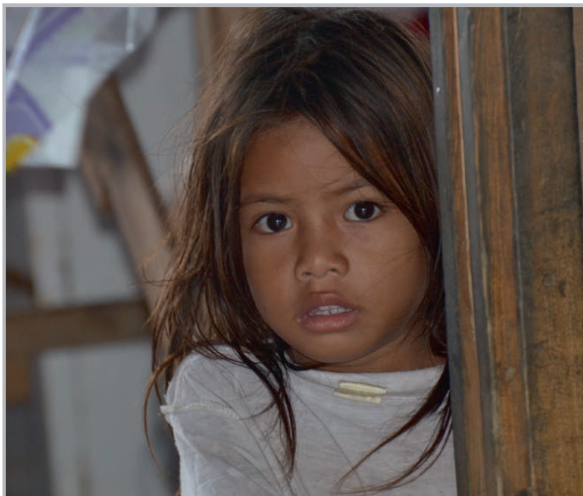
One of the little girls from the Tuvalu village family