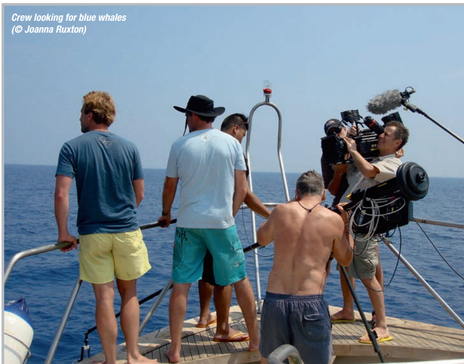
Crew looking for blue whales